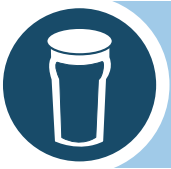
Table service only. A menu is in your seating area and staff will come to you to take your order. Contactless payment is preferred.

Please remain seated during the trip unless accessing the toilets and stay within the designated walkways.